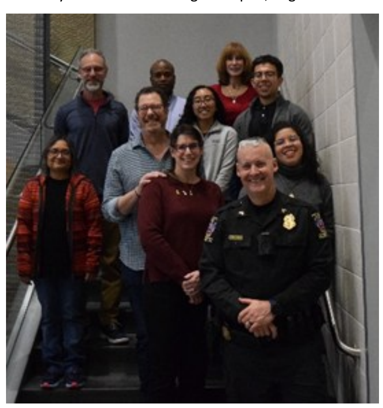
Graduates of Citizen Academy Session 74

Congrats to the graduates of Session 74! They were actively involved in each night's topics, eager to