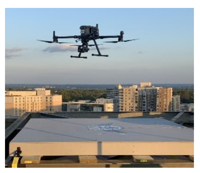
Drone as a First Responder

learn, and asked challenging questions which kept the instructors on their A-game. I wish them luck in their future endeavors.