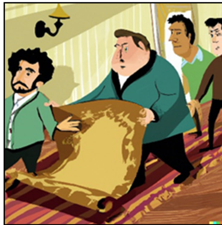
The “Rug Pull”

A rug pull is a type of cryptocurrency scam where the creators of a project or investment suddenly exit the market, taking all the invested funds with them. The name "rug pull" comes from pulling the rug out from under investors, leaving them nothing. In a