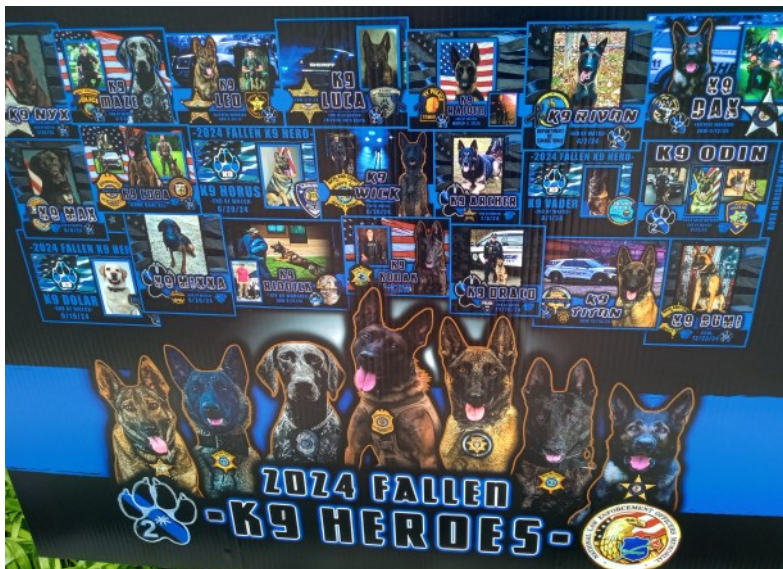
PW 2025 Pics