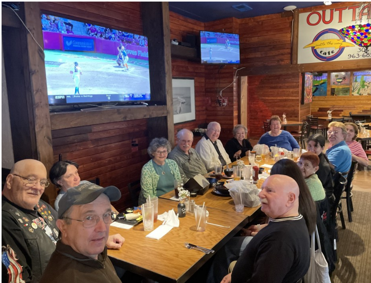
From our Spring Social at The Outta the Way Cafe