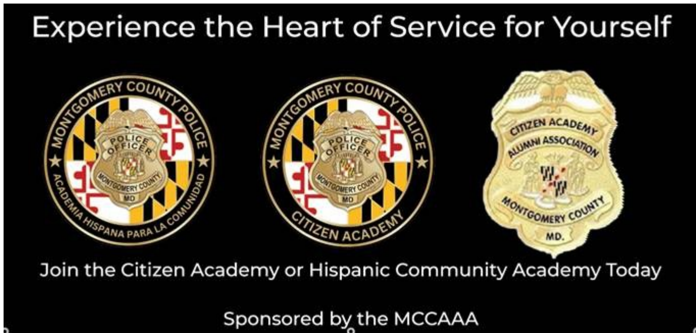
Banner for MCCA AAA to use at the Olney Farmers market