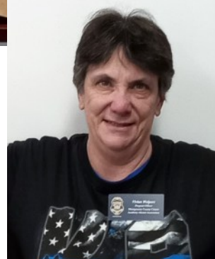
4D Goodie Bags Delivery